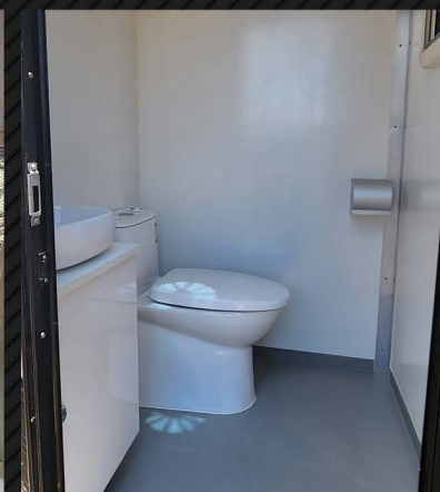
HIRE & RENTAL